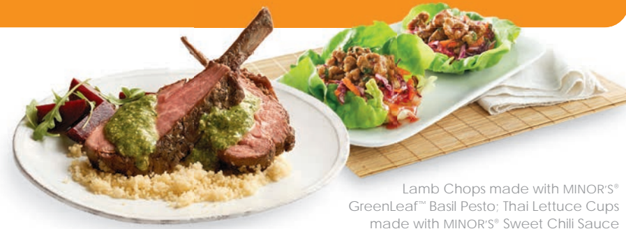
Lamb Chops made with MINOR'S® GreenLeaf™ Basil Pesto; Thai Lettuce Cups made with MINOR'S® Sweet Chili Sauce

YES! I would like to receive future information from Nestlé Professional via email and/or postal mail.